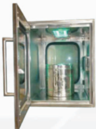
SS Pass Box