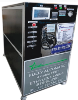
Fully Automatic Full Body Model