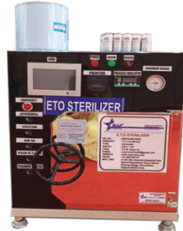
Fully Automatic Table Top Model