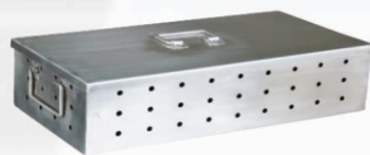
SS Perforated Instrument Box