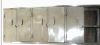
SS wall mounted Storing Rack