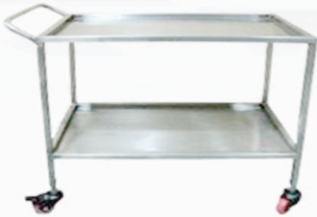
SS Table Trolley