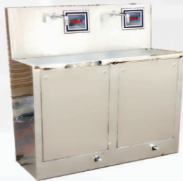
Ss Washing Sink