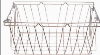
SS Modular Basket