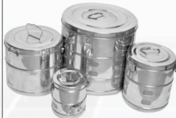
SS Dressing Drum