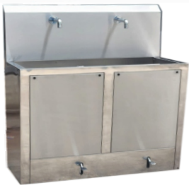
SS FOOT OPERATED SINK - 2 BAY