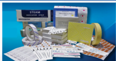
All Type Indicators