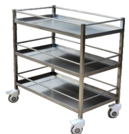
Three Tyre Trolley