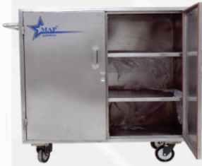
SS ENCLOSED DISTRIBUTION TROLLEY FOR STERILE GOODS