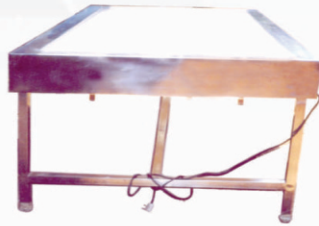
SS Linen Inspection Table