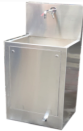
SS FOOT OPERATED SINK - 1 BAY