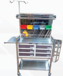
SS Crash Cart Trolley