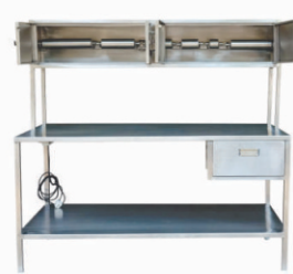
SS PACKING, SEALING & LABELING