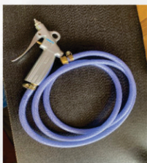
SS Water Gun